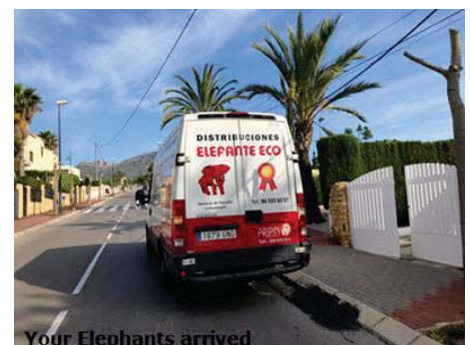
Your Elephants arrived