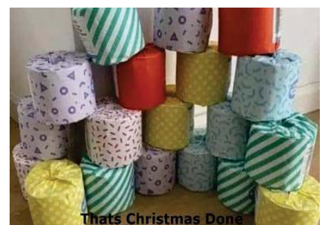
Thats Christmas Done

We hope to run another similar feature in a few months time so please keep your photos for next time if you missed this months deadline.