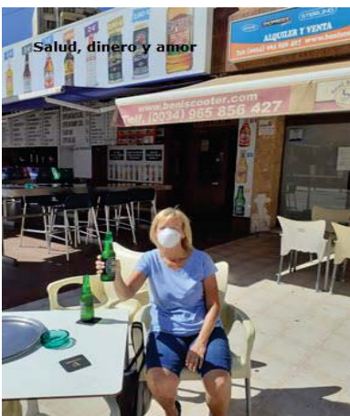
Salud, dinero y amor