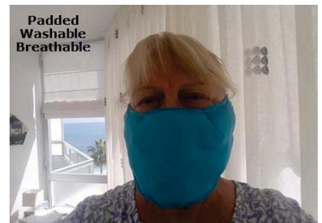
Padded Washable Breathable