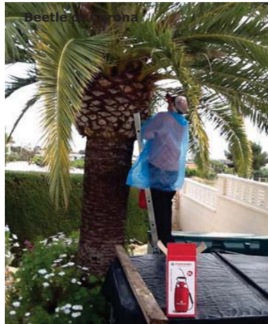
Beetle in Corona