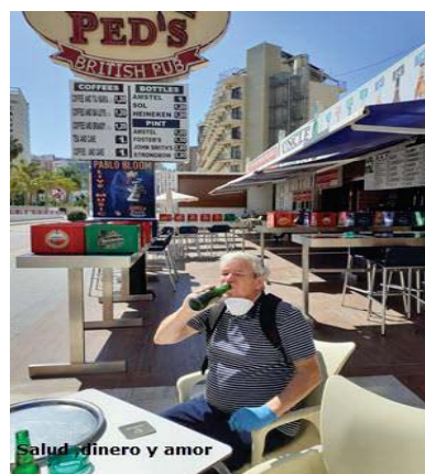
Salud, dinero y amor