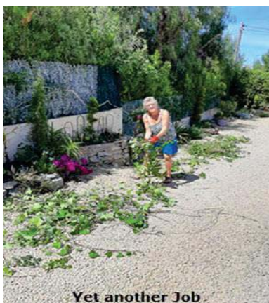
Yet another Job

Last month we asked you to send in a photo with a three word caption.