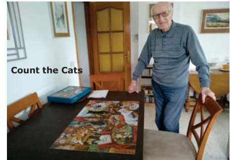
Count the Cats