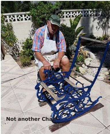
Not another Chair