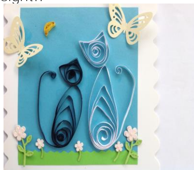
Article and Pictures by Anne Riddel

There are always craft magazines that people bring in and there was an article in one of them!! I am an absolute novice with bad eyesight!!